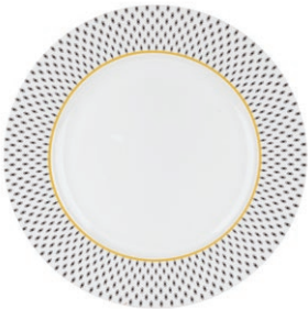
dinner plate (langdon black) 26.5cm/10.5" TBGLK77165-XF