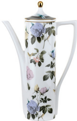
tall beverage pot (white) 1.25L/44oz TBRLW77151-XG