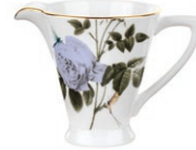
cream jug (white) 0.25L/9oz TBRLW77155-XG