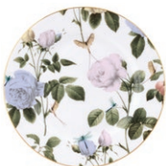
salad plate (white) 22cm/8.5" TBRLW77144-XF