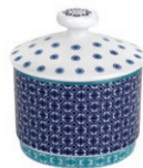
covered sugar (langdon blue) 0.25L/9oz TBGLB77184-XG