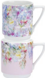
stacking mugs set of 2 (hangarden) 0.28L/10oz TBHG77171-XG