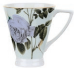
footed mug (mint) 0.35L/12oz TBRLM77150-XG