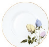
bread & butter plate (white) 15cm/6" TBRLW77139-XF