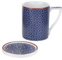
mug & coaster (malton II) 0.35L/12oz TBGM277169-XG