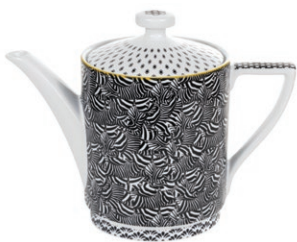
teapot (langdon black) 1.1L/2pt TBGLK77182-XG