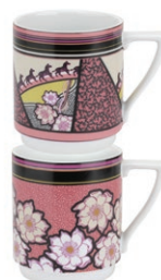
stacking mugs set of 2 (tribalmix) 0.28L/10oz TBTR77171-XG