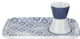
egg cup & snack plate (blanchard blue) 23cm x 16cm/9" x 6.25" TBGBB77172-XG