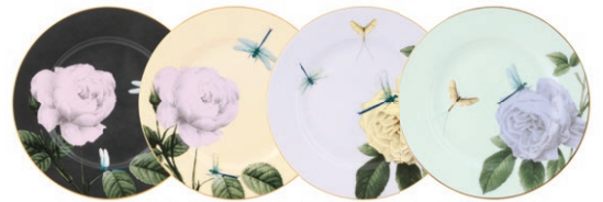
salad plate set of 4 (assorted) 22cm/8.5" TBRL77142-XG