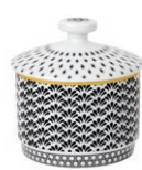
covered sugar (langdon black) 0.25L/9oz TBGLK77184-XG