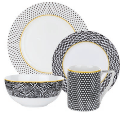
4 piece set (langdon black) dinner plate: 26.5cm/10.5", salad plate: 20cm/8" cereal bowl: 15cm/6", mug: 0.35L/12oz TBGLK77168-XG