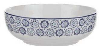
salad bowl (langdon blue) 24cm/9.4" TBGLB77189-XG