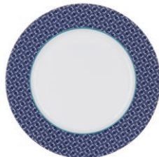
salad plate (langdon blue) 20cm/8" TBGLB77166-XF