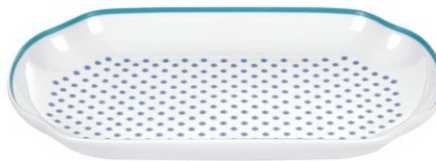
platter (langdon blue) 35.5cm/14" TBGLB77186-XG