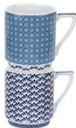
stacking mugs set of 2 (balfour III & IV) 0.28L/10oz TBGBB77171-XG