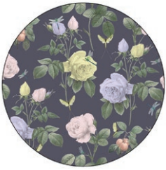
round placemats set of 4 (rosie lee) 31cm/12.25" X0012348822