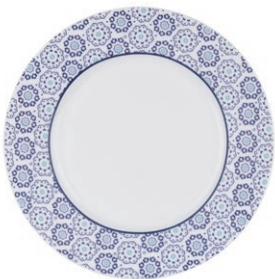
dinner plate (langdon blue) 26.5cm/10.5" TBGLB77165-XF