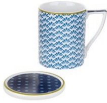
mug & coaster (malton I) 0.35L/12oz TBGM177169-XG