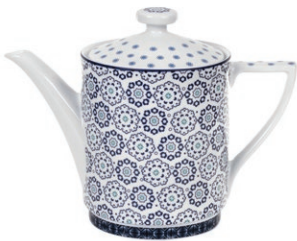
teapot (langdon blue) 1.1L/2pt TBGLB77182-XG