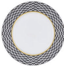
salad plate (langdon black) 20cm/8" TBGLK77166-XF