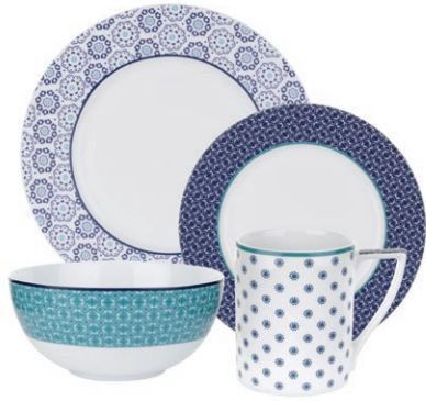
4 piece set (langdon blue) dinner plate: 26.5cm/10.5", salad plate: 20cm/8" cereal bowl: 15cm/6", mug: 0.35L/12oz TBGLB77168-XG