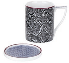
mug & coaster (malton IV) 0.35L/12oz TBGM477169-XG