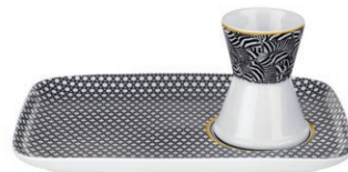
egg cup & snack plate (blanchard black) 23cm x 16cm/9" x 6.25" TBGBK77172-XG