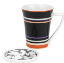
mug & coaster (tribalmix) 0.34L/12oz TBTR78602-XG