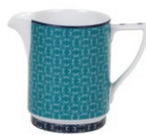
cream (langdon blue) 0.25L/9oz TBGLB77183-XG