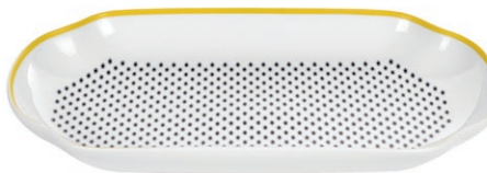
platter (langdon black) 35.5cm/14" TBGLK77186-XG