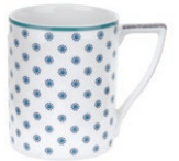
mug (langdon blue) 0.35L/12oz TBGLB77176-XF