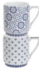
stacking mugs set of 2 (balfour V & VI) 0.28L/10oz TBGBC77171-XG