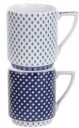
stacking mugs set of 2 (balfour VII & VIII) 0.28L/10oz TBGBD77171-XG