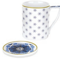
mug & coaster (malton III) 0.35L/12oz TBGM377169-XG