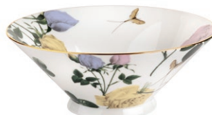
centrepiece bowl (white) 25cm/10" TBRLW77163-XG