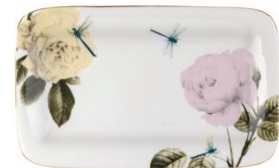
sandwich tray (white) 25cm x 15cm/10" x 6" TBRLW77158-XD