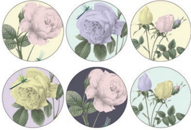
round coasters set of 6 (rosie lee) 10.5cm/4" X0010468822