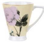
footed mug (lemon) 0.35L/12oz TBRL77150-XG