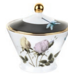
covered sugar bowl (white) 0.23L/8oz TBRLW77154-XG