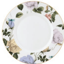
dinner plate (white) 26.5cm/10.5" TBRLW77141-XF