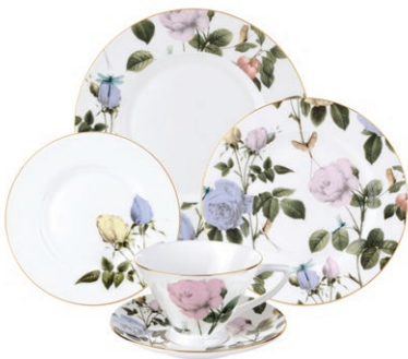
5 piece set dinner plate: 26.5cm/10.5", salad plate: 22cm/8.5" bread & butter plate: 15cm/6", teacup & saucer: 0.23L/8oz TBRLW77138-XG