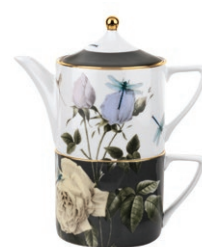
tea for one 0.28L/10oz TBRL77152-XG