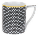
mug (langdon black) 0.35L/12oz TBGLBK77176-XF