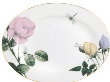
oval platter (white) 30cm/12" TBRLW77164-XG