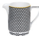
cream (langdon black) 0.25L/9oz TBGLK77183-XG