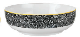
salad bowl (langdon black) 24cm/9.4" TBGLK77189-XG