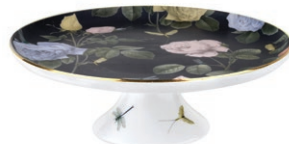
footed cake stand (black) 25cm/10" TBRLB77156-XG