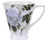
footed mug (lilac) 0.35L/12oz TBRLC77150-XG