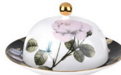
covered starter dish 20cm/8" TBRL77159-XD