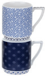
stacking mugs set of 2 (balfour I & II) 0.28L/10oz TBGBA77171-XG