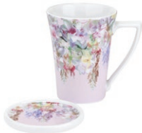
mug & coaster (hangarden) 0.34L/12oz TBHG78602-XG