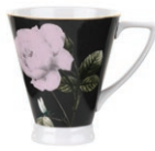
footed mug (black) 0.35L/12oz TBRLB77150-XG