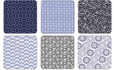
placemats set of 4 (langdon) (m) 30.5cm x 23cm/12" x 9" X0010548823