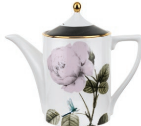
teapot (white) 1.1L/40oz TBRLW77153-XG